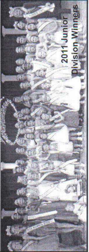
2011 Junior Division Winners

DEADLINE TO ENTER IS JANUARY 6, 2012 There will be several Junior Division and Teen, Miss and Mrs. winners crowned!!!